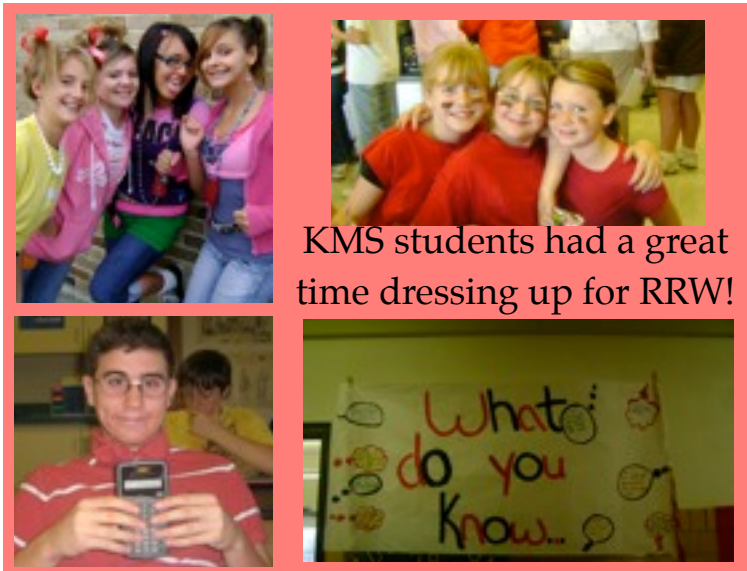
KMS students had a great time dressing up for RRW!

This year's convention was a huge success! All the candidates did really well with their speeches and all the homerooms did awesome! Also, the 6th grade choir did a great job singing. Since this is my first year at Kenton Middle School, I asked